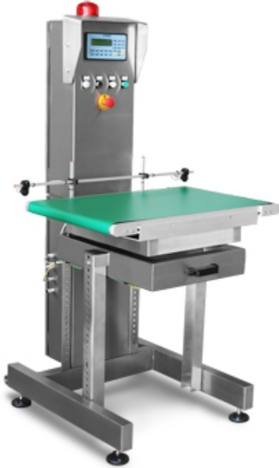
Stainless steel version.